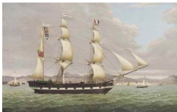
THE BARQUE “ RENOWN ” GOING DOWN THE CLYDE