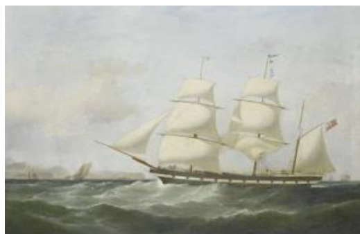
THE BARQUE WALTER MORRICE CALLING FOR A PILOT OFF POINT LYNAS